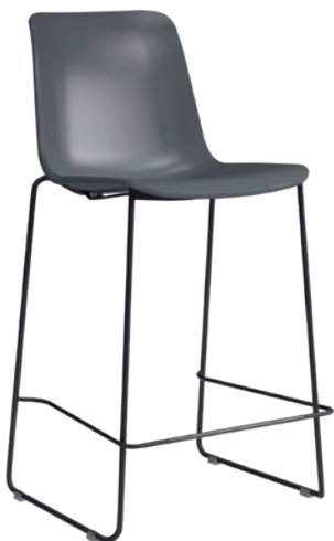
BarZenith ht65 ep01 PZ72