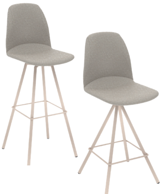
BarOsaka ht80 ep81 V480